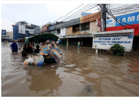
Heavy flooding in Jakarta, Indonesia.

UNITED NATIONS, Jun 18 2015 (IPS) - Natural disasters have become a fact of life for millions around the world, and the future forecast is only getting worse.